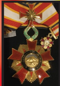
Timor Medal Awarded to SETSG 2025

Join with us to celebrate 30 Years of support for Timor Leste'