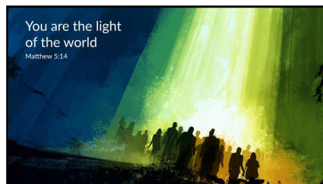
You are the light of the world Matthew 5:14

We could pause for a moment to pray that we remain salty and tangy, doing good beautifully and elegantly.